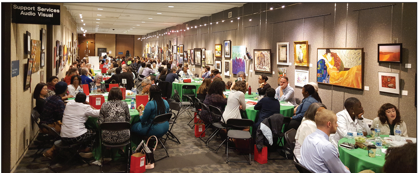
Small group discussions at the symposium.