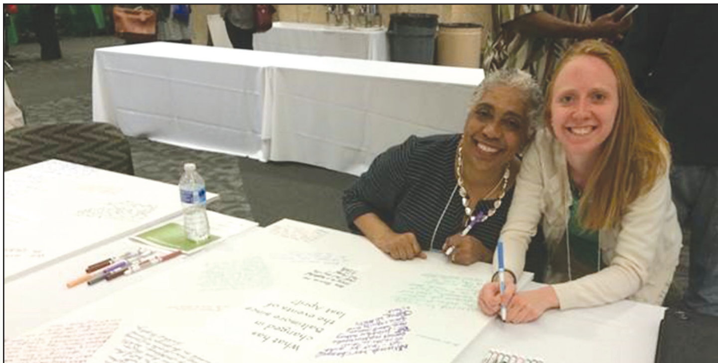
Interactive art project at the symposium.