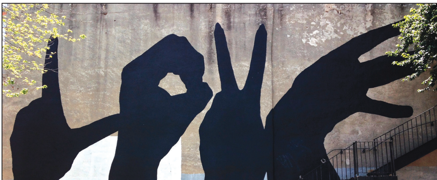
One of 20 love walls around Baltimore, Maryland, part of the Baltimore Love Project. This is in southwest Baltimore near Hollins Street Market.