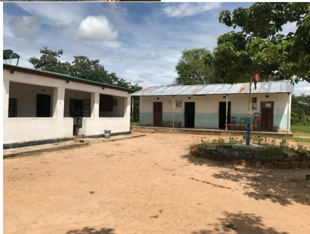
Top left: An example of a data logger in the village of Simuwana.