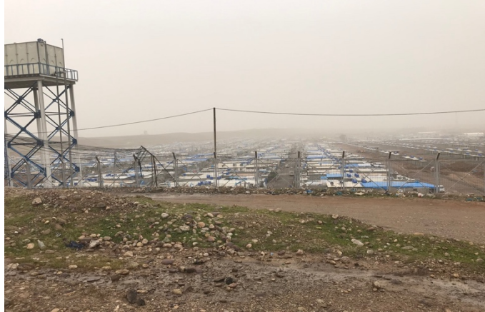
Kawargosk Refugee Camp, Erbil Governorate

Working on this project in KRI provided me valuable experience conducting research in a complex humanitarian environment. I learned about sampling strategies in emergencies and improved my skills in survey design and implementation. Through my personal interactions, I also gained a better understanding of the Kurdish region and the effects of movement of refugees and IDPs across the Middle East on women and girls. Observing and participating in UNFPA activities, including a gender-based violence working group meeting at UNHCR, was professionally beneficial because I hope to work for these organizations on GBV prevention and response in the future.