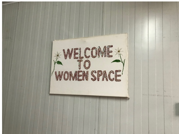
Women's Space, Kawargosk Refugee Camp