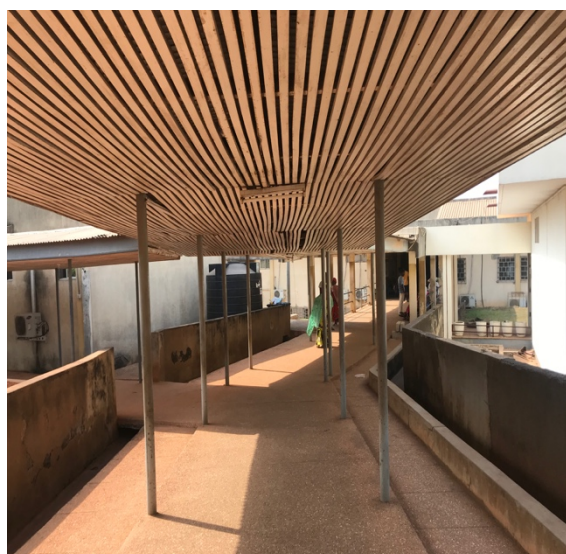
Picture 1. Komfo Anokye Teaching Hospital, Kumasi