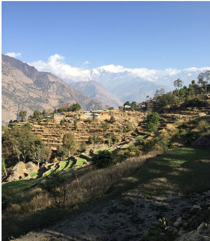
Village of Jharlang (estimated population of 3000 to 5000 people).

JOHNS HOPKINS BLOOMBERG SCHOOL OF PUBLIC HEALTH