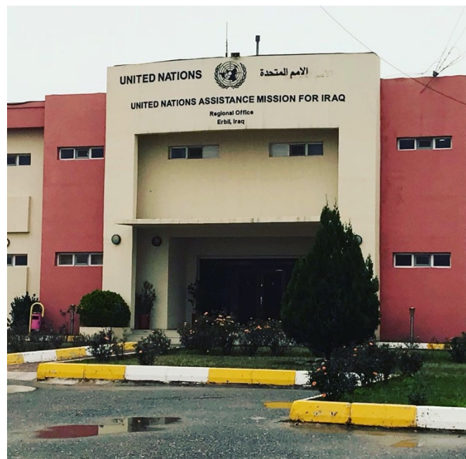
UNAMI Compound, Erbil

In KRI, I worked out of the UNFPA offices in Erbil and Sulaymaniyah with the gender-based violence team. During the first part of the trip, my work focused on finding population estimates to inform the sampling strategy, as well as training local staff on the Magpi data collection software. Later, my work shifted to troubleshooting procurement